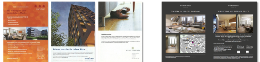
Property presentation - panoramic spread Placement after real estate presentation